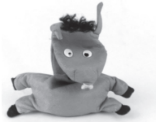
Ill. 1: Green Knautschi for sale on Etsy. ( https://www.etsy.com/de/listing/179199647/original-knautschi-dbgm-westdeutschland , checked October 23, 2015)

Socialization devotes a great deal of attention to the acquisition of socially and morally appropriate