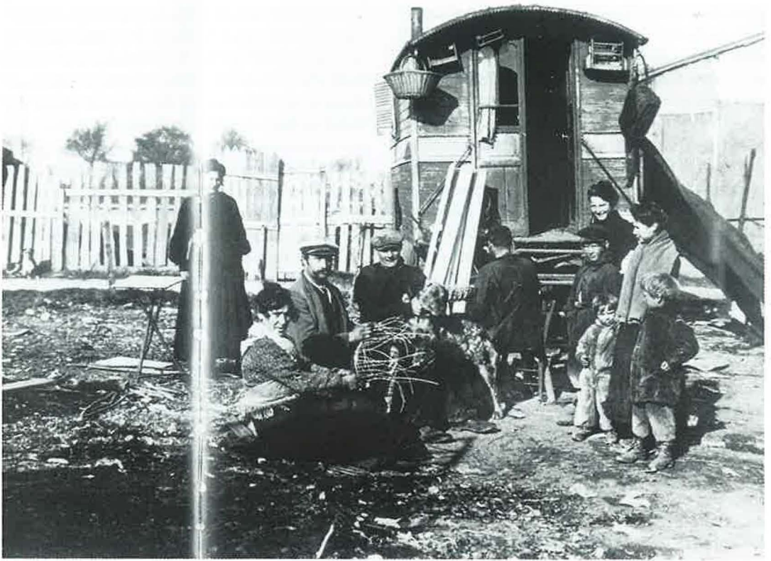
Fig. 6. French basket weavers around 1900.