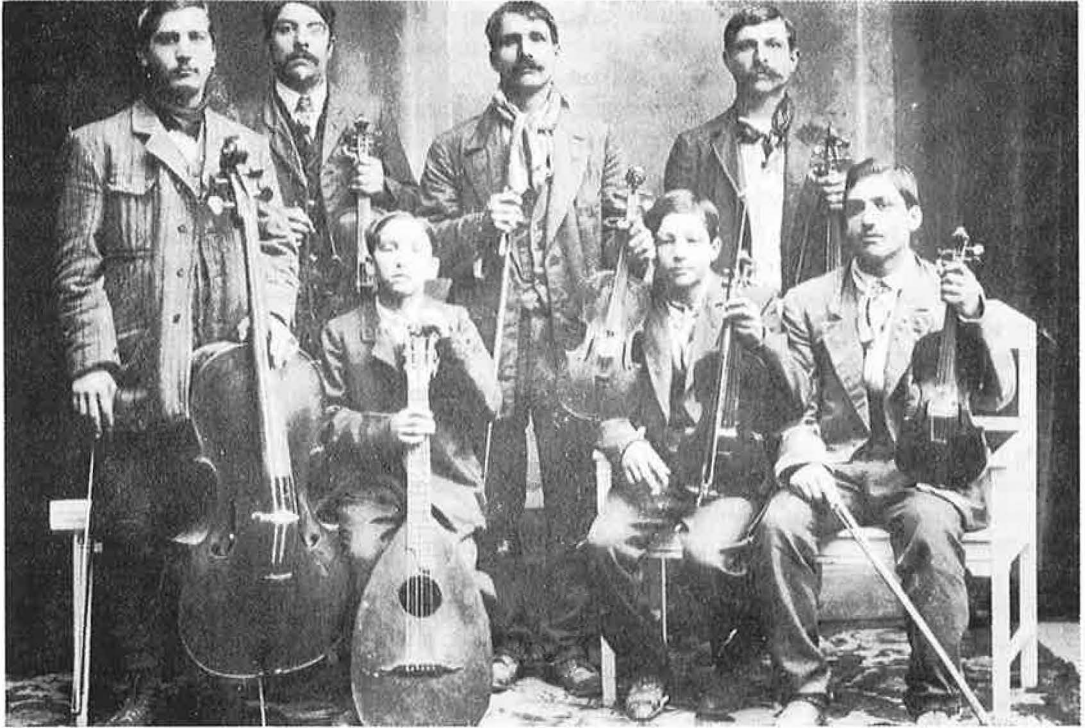
Fig. 5. German gypsy orchestra.