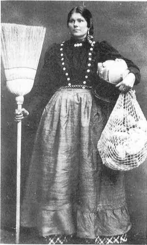
Fig. 1. Female hawker from Matzenbach (Palatine) around 1890.