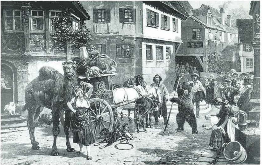
Fig. 4. Animal leaders from Italy, probably in Germany around 1890.