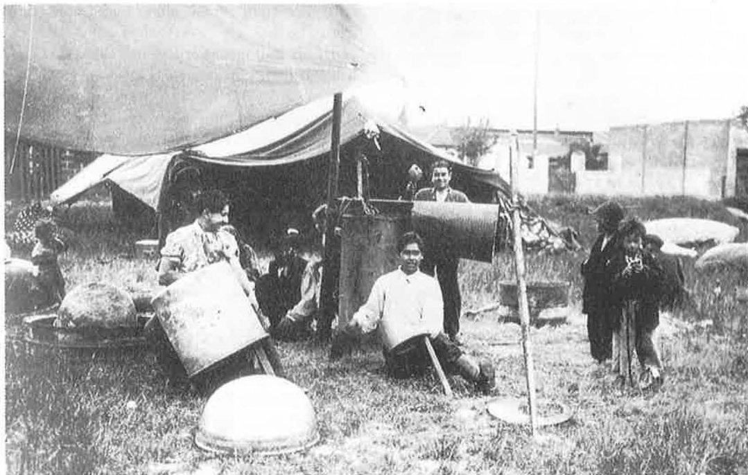
Fig. 2. Encampment of gypsy coppersmiths in France around 1900.