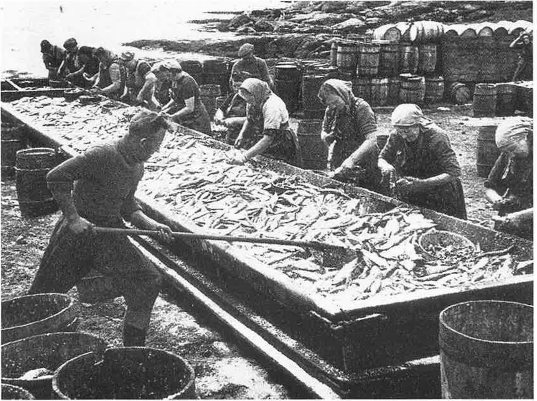
Women at the “farlins”, Castlebay, Barra, in the Outer Hebrides. Note that this is a temporary station set up on the beach; the season here was brief.

its size and grade ( smaa', matje, full, mak' full, torn belly ). The packer tended the barrels, arranging the fish in layers, adding salt, replacing the filled barrels with empties. The curer's agent checked the barrels at intervals to make sure the herring was of the right quality and the barrel was properly packed before it was sealed by a cooper. The work was hard on the legs, backs, and especially the hands. Rubber gloves were virtually unknown in this work. The girls bound their fingers with strips of cloth ( cloots ) which they tied with their teeth, but cuts were inevitable, made very painful because of the salt, and often became infected. Their clothes became saturated with fish oil, blood, salt and rain, and covered with a silvery patina of fish scales. Although they wore heavy leather boots and oilskin aprons over their woollen skirts and short-sleeved jerseys, it was impossible to keep clean and dry.