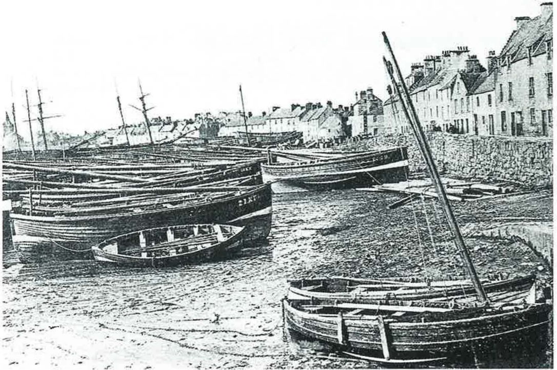
Low tide at the harbour. The villages of Anstruther and Cellardyke are contiguous. The spire to the extreme left is in Anstruther; the fishers' cottages on the right are in Cellardyke.

them northwards to the Faroe Islands on trips lasting up to three weeks; others fished closer to home for white fish.