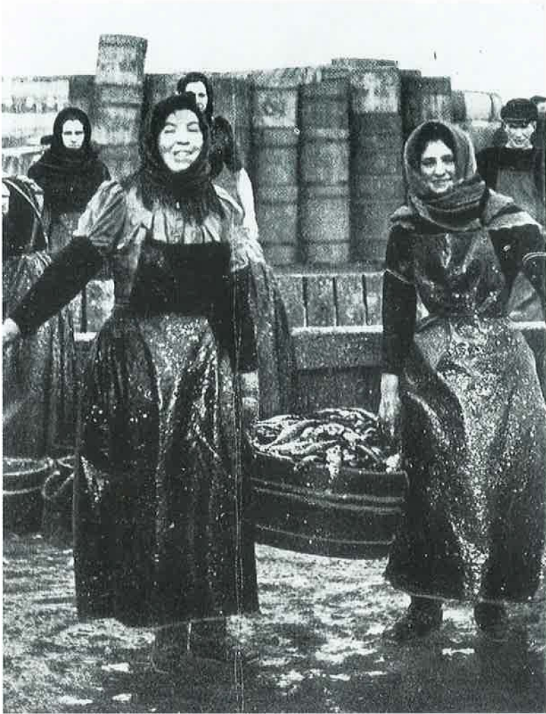
Scottish fisherwomen at Lowestoft, Suffolk, the main port for the East Anglian herring fishery.

Russia and the Baltic countries. Girls started work as gutters at the age of fifteen or sixteen, and might continue seasonally for ten or twelve years, until they married in their middle or late twenties. After a woman began to have children, matters became more complicated, but from necessity many continued nevertheless, leaving small children in the care of a grandmother, and taking along school-aged children. Schools permitted children to accompany their mothers on their travels on condition that the children were put in a school on arrival at the port, to ensure they completed their legally-obligatory annual number of days' schooling. The Pittenweem school records show that 40 to 50 children were accom-