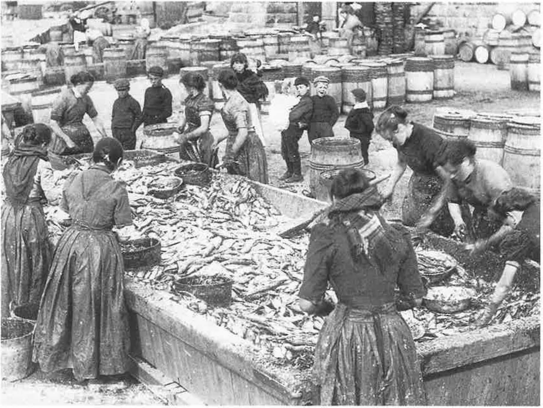
Women gutting herring at Peterhead, on the Buchan coast of Scotland. Note the presence of children.

their movements, the season might last only a two or three weeks in some places, perhaps even a few days in others.