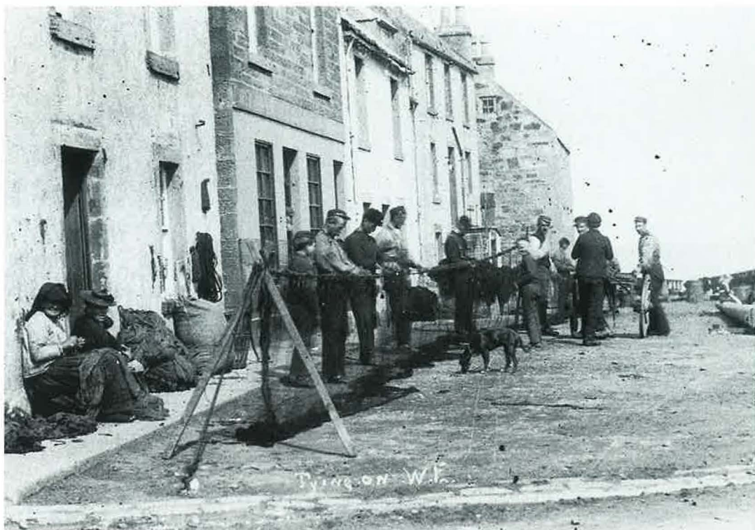
Two women (at left) mend, while the men tie the nets to the "buss rope" in the streets of St Monans, Fife.

taking task was a part of the lot of most fishermen's wives and daughters during the haddock seasons the length of the Forth coast, until the adoption of the seine net in the late 1930s and early 1940s.