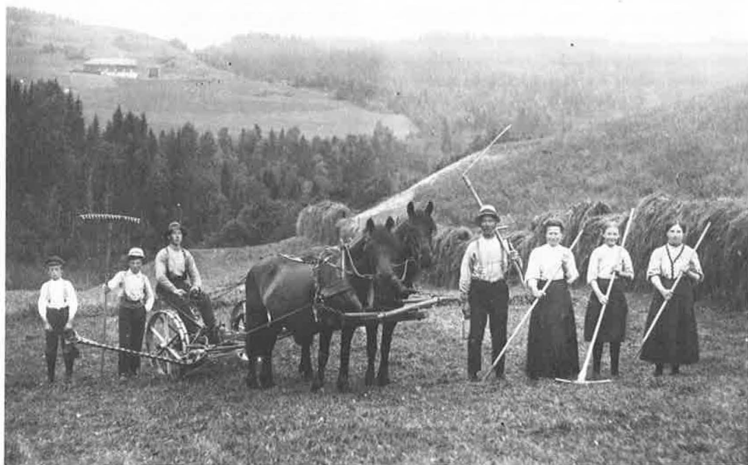
Haymaking around 1914 (left) and the 1950's (right) at Haugum, in Skaun. In the two periods shown, both technology and the sexual division of labour are mainly the same, but the way people pose in front of camera is very different. Observe the boy with the rake on the left photo. He works together with the women and the girls because he is still too young and not skilled enough to do man's work with the scythe.

accompanied their father in the traditional male field work. But children growing up in households with both girls and boys were socialized into the adult division of labour from an early age. The girls followed their mother in their work, and the boys had the father as their teacher. So the girls, among other tasks, did housework as a favour to their brothers.