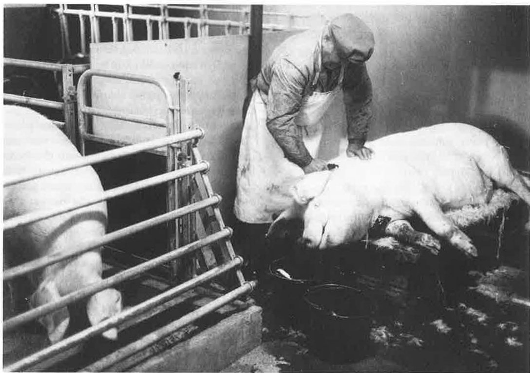
Slaughtering of pigs at Engen in Skaun. Until the 1960's the slaughtering was an annual event on every farm. Today the animals are usually sent to the slaughterhouse.

To be a farmer, male or female, is to accept labour as a fundamental condition of life. To many farmers, life is equivalent to work, and vice versa. This profound acceptance of life being equivalent to hard work, should be seen in connection with the peasant family's economic strategy. The objective of the project for the future of a young peasant couple "is aimed at creating alliances which ensure accession to ownership of the land, or its development, or yet again to prevent its being broken up" (Segalen 1983: 13). In this strategy the preservation and the improvement of the farm are paramount, marriage and child births being instruments to fulfill the project for the future (Thorsen 1986 b). The attitudes to labour in the peasant life-mode may be considered components of a "key scenario". The key scenarios of a culture "both formulate appropriate goals and suggest effective action for achieving them, / ... / in ot-