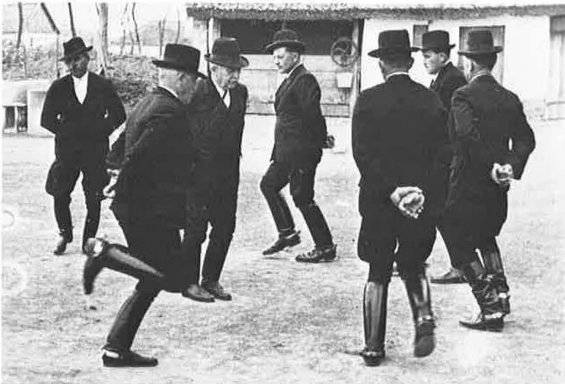
5. “Cumanian verbunk ”, a popular variant of the historic soldiers’ recruiting dance. Kunszentmiklós, County Bács-Kiskun, 1959.

In Hungary the verbunkos , the recruiting dance, became the national dance of the Hungarians. Recruiting in eighteenth century was a frequent occurrence during which village