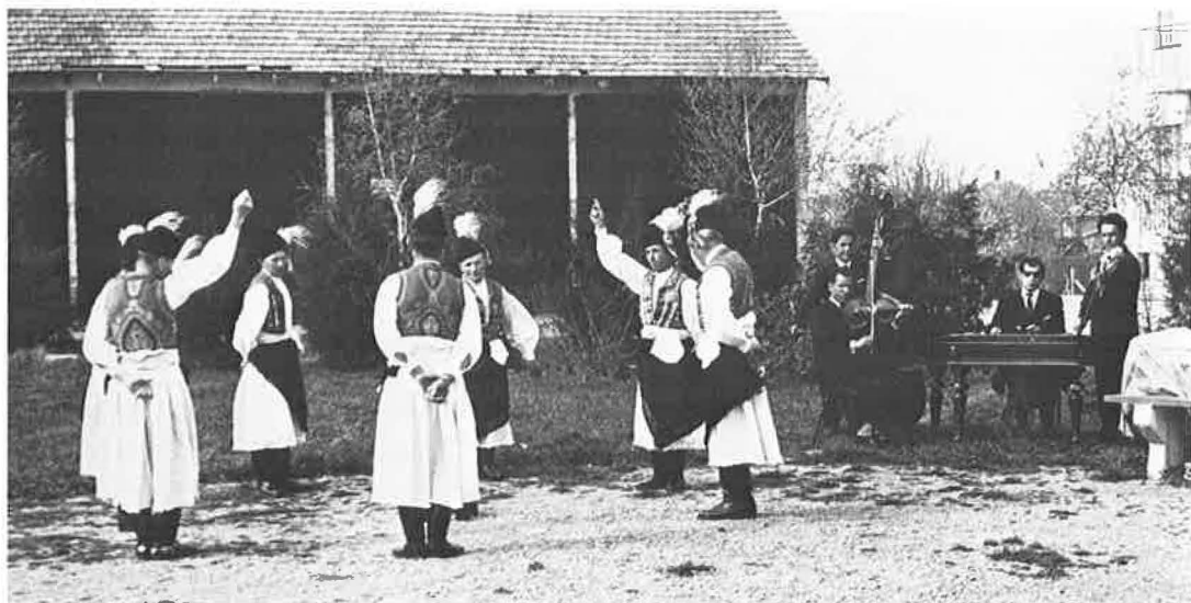
4. Round verbunk dance, a popular survival of the historic soldiers' recruiting dance tradition. The start of the dance. Szany, County Győr-Sopron, 1971.

new era began in Hungarian history, the hajdus completely lost their important role and privileges. The Habsburgs attempted to eradicate all memories of the insurrectionist uprising under Rákóczi (1703–1711) in which the hajdus played their last important role. Thus, for example, playing the Turkish pipe or tárogató was forbidden, because it was also a reminder of the rebellion. In this changed historical context the hajdu weapon dance lost its former symbolic relevance. By the eighteenth century the hajdu dance once again reverted and became restricted to the herdsmen and peasant strata.