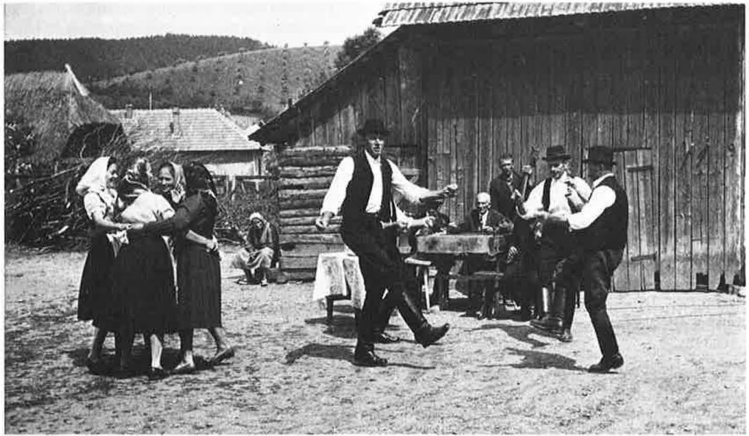
6. " Lassu magyar " (slow Hungarian) dance. Three men dancing in front of the gypsy musicians. Their movements show traces of the old male solo dances. Afterwards, in the quick phase, the men will dance in pairs with the women. Bonchida – Bonțida, Transylvania, Roumania, 1969.

lads were persuaded to join the army by drinking, revelry, music and the verbunkos dance. In the eyes of the national elite (noblemen) this dance was a symbolization of the military past, the courage, and of the struggle for independence. The Slovaks selected the herdsmen's dances of the northern mountainous region for their own national dance, the hajduch and odzemok with which they associated the legend of the outlaw Jánošík who fought against the Hungarians and Austrians as well. Roumanians who lived in three separate countries (Moldavia, Muntenia and Transylvania) and who sought unification with one another have chosen the collective ritual male dance, the căluș . This dance represented for them the heritage of the Romans and the alleged historic foundation of their desired unity. (Proka 1954, 1979, Oprișan 1969). Recent historical events and distant historical myths played an equally important part in the establishment of national dance consciousness and in the choice of dance types as the actual political and social efforts.