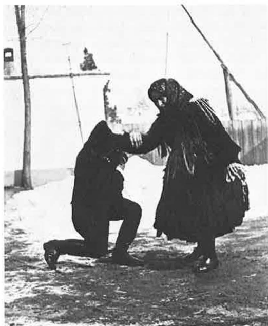
7. "Gyors csárdás" (quick csárdás ). The standardized national dance performed with additional improvisations in local style. Apátfalva, County Csongrád, 1956.

The new dances that evolved by stylization were soon popularized as a consequence of widespread institutional promotion. Through the activities of dancing-masters and dancing-schools the national dances were fitted into local folklore. By the turn of the 19th and 20th centuries the unificatory impact of the national dance types in each national language-territory had its result and the dance types developing during the period of national reform were consolidated. Subsequently they have been regarded at home and abroad as the most significant and even exclusive representatives of the national dance cultures.