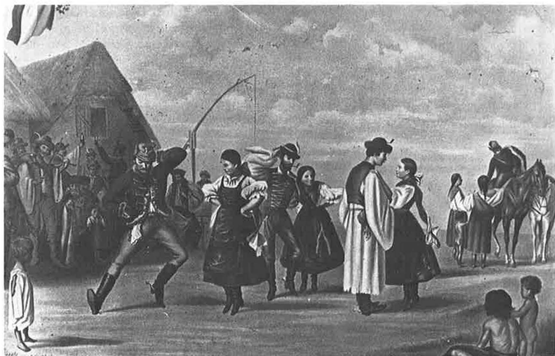
3. Csárdás -dancers in the Great Hungarian Plain, mid-nineteenth century. A scene of soldiers' recruitment. In the center, a peasant lad takes leave of his girl-friend, two other pairs are dancing with free improvisation. In the background a gypsy orchestra, in the foreground gypsy children. – Chromolithography of an unknown artist.

After the Turkish occupation was over and a