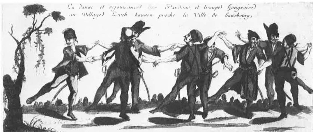
2. Dancing Hungarian soldiers and pandours. They are performing a chain-dance of mediaeval background which illustrates the collective character of the hajdu and soldier dances. – Coloured etching of an unknown artist, 18th century.

was mentioned only in a pejorative tone. Moreover, this critical attitude was aggravated by the explicitly puritanical, anti-dance spirit of the Reformation Period (cf. Balogh 1969, Módy 1969, 1972, 1975, Pesovár 1972).