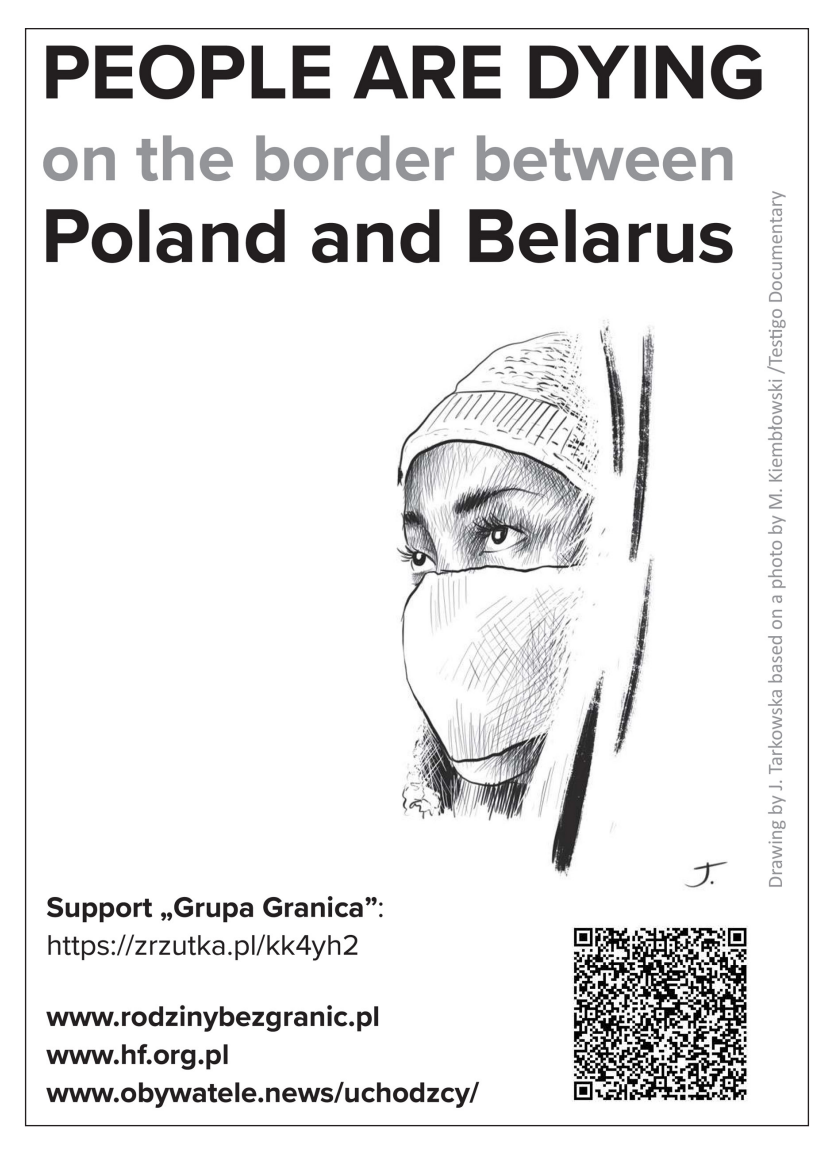
Figure 2: Leaflet distributed by volunteers linked to Grupa Granica . (Drawing by J. Tarkowska based on a photo by M. Klembowski/Testigo Documentary).

demonstrations and information actions.<sup>4</sup> In social networks, people discussed how to talk with acquaintances, friends, family, and neighbours seeing the refugees as a threat or arguing that helping them is equal to supporting Lukashenko's or Putin's regimes. Most importantly, there were people, both locals and volunteers from other parts of Poland, who searched for refugees stuck in the woods and supplied food, sleeping bags, dry clothes, as well as legal advice and medical help.